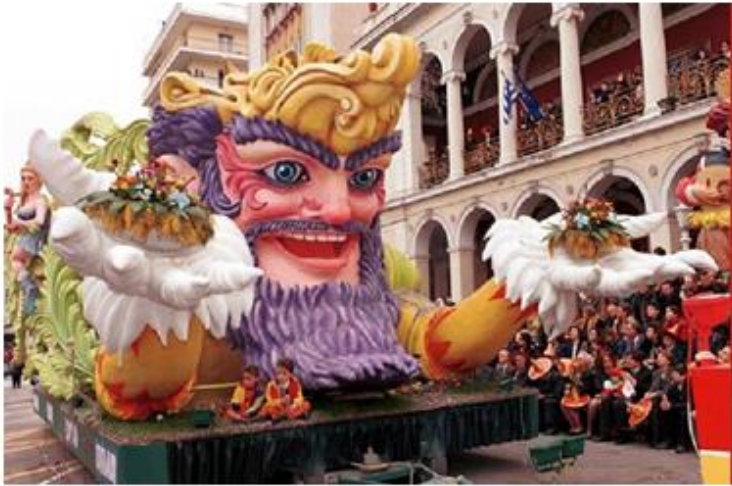
Flatbed vehicle float