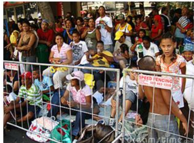
Spectators at the Cape Town Minstrel Carnival, Cape Town